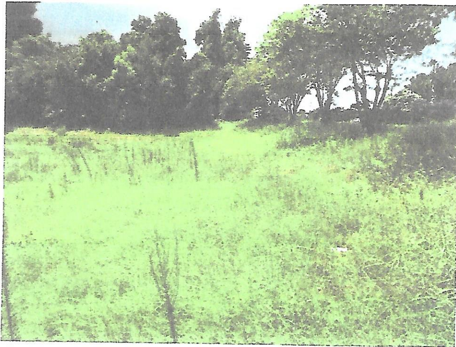
Area of prior subsidence on Tract B, no sign of subsurface activity.