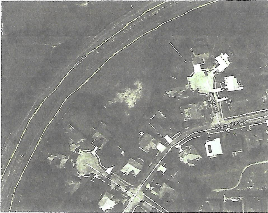
Retention pond Tract A, between Ironwood Dr. and Spoon Ct.