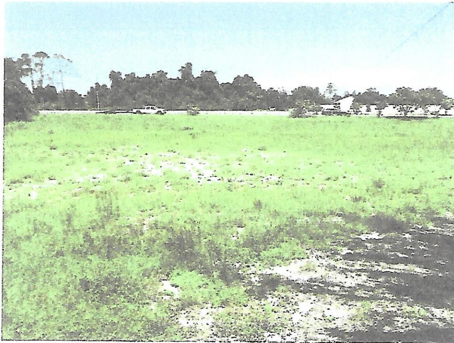
Retention pond Tract A looking southwest.