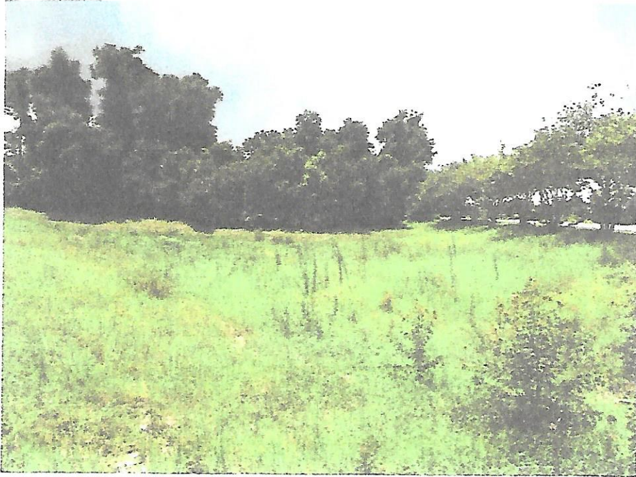
Retention pond Tract B looking south.