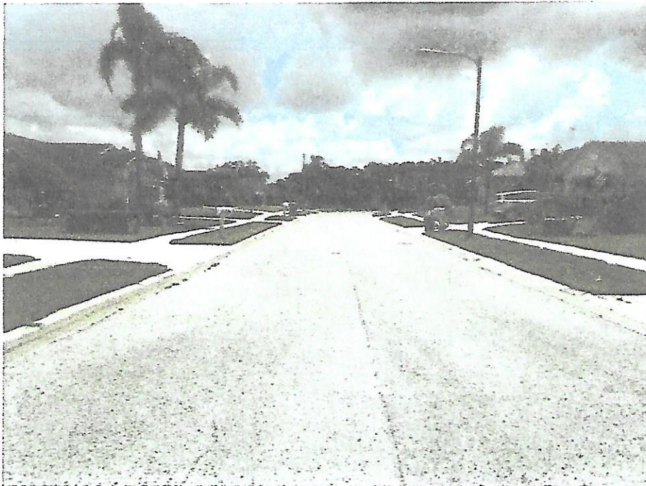
Roadway curb and gutter.